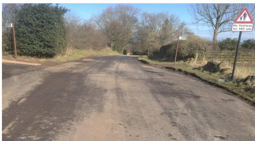
Broad Elms Lane between Broad Elms Close and Whirlow Lane

Officer comment: The north-eastern section of Broad Elms Lane, from Bents Road to Alms Hill Road, was included within the original proposal. The request relates to the remainder of Broad Elms Lane. This part of Broad Elms Lane is not street-lit and therefore currently appears to be subject to the national speed limit of 60mph although there are no road signs to this effect. The current average speed of traffic is 24.1mph (two-way 12-hour average, 7.00am – 7.00pm, February 2016). It was originally omitted from the scheme as it is primarily rural in character and the implementation of the Sheffield 20mph Speed Limit Strategy is expressly limited to an urban environment with no provision to roll out the lower limit into the rural