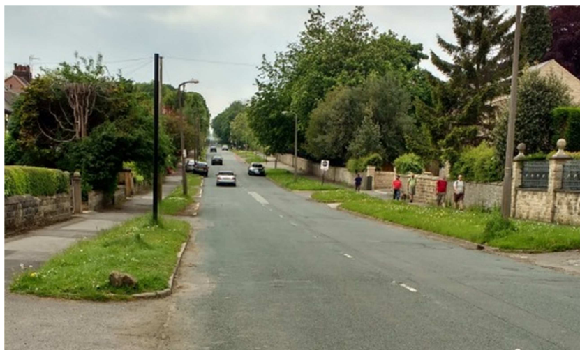
Ringinglow Road between Folkwood Grove and Bents Drive

"We live on Bents Drive and so have daily experience of this part of