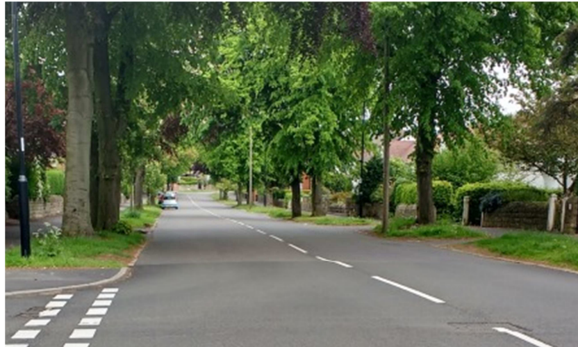
Knowle Lane near Haugh Lane

that they should be part of the 20mph area.