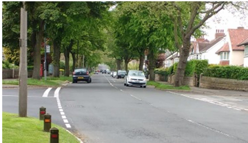
Bents Road near Broad Elms Lane

Knowle Lane is effectively an extension of the western section of Ringinglow Road discussed in paragraph 4.8 above. Both Knowle Lane and Bents Road are wide through routes with properties set well back from the road. Existing speeds are close to and above the upper threshold for roads to be considered suitable for the introduction of a 20mph limit. Neither road passes a school. Officers agree that the appropriate speed limit of Bents Road and Knowle Lane is 30mph and recommend that this element of the objection be upheld.