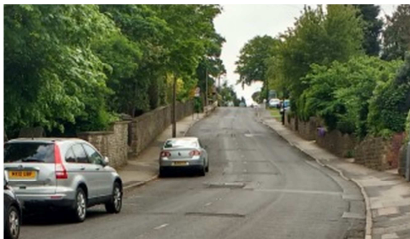
Ringinglow Road between Edale Road and Falkland Road

In deciding whether or not to recommend the inclusion of these roads officers have looked again at their characteristics, the function they serve (all are bus routes) and the existing speed at which drivers travel.