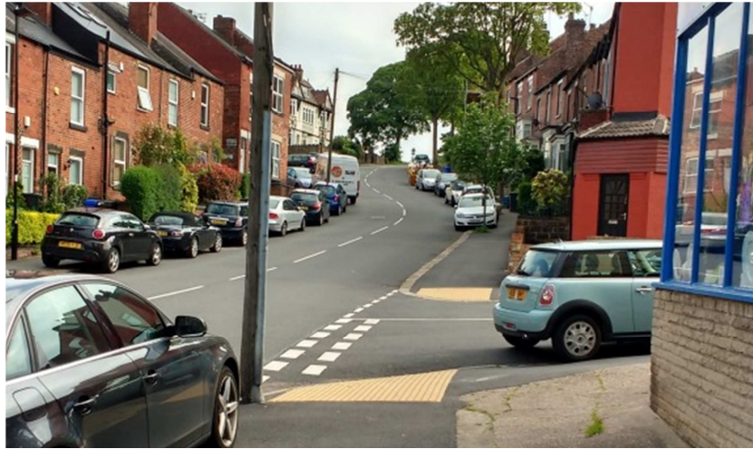
Hangingwater Road near Armthorpe Road

both sides. The average speed of traffic on Hangingwater Road (as measured at Bramwith Road) is well below the 27mph threshold described in paragraph 4.2 above.