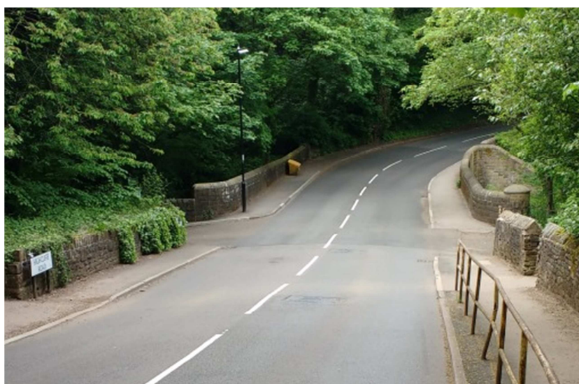
Hangingwater Road/Highcliffe Road

Officer Comment: Much of Highcliffe Road and Hangingwater Road are not residential but are used and crossed by many walkers, allotment holders and school children walking between the two sides of the Porter Brook valley. The footways to the south of the Porter Brook are extremely narrow and overgrown although there is a lit footpath across land to the east of the road. There is a footway on one side of Hangingwater Road between the Porter Brook and Whitely Woods Road. North of Whitely Woods Road Hangingwater Road becomes more residential and north of Armthorpe Road there is a footway on