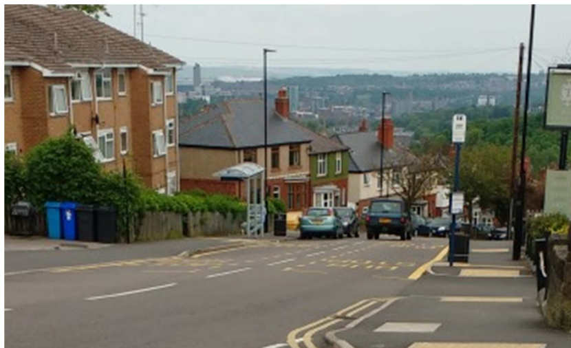
Greystones Road between Greystones Drive and Bingham Park Crescent

Existing speeds are higher on the section of Ringinglow Road from Bents Green Road to High Storrs Road and on Greystones Road, although still below the 27mph threshold. Both routes pass large schools (Greystones Primary and High Storrs), and in the case of Ringinglow Road runs through a local shopping centre. Officers feel that on balance their inclusion would be in-keeping with the spirit of the 20mph Speed Limit Strategy and recommend