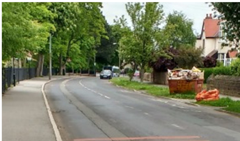
Ringinglow Road between Bents Green Road and High Storrs Road